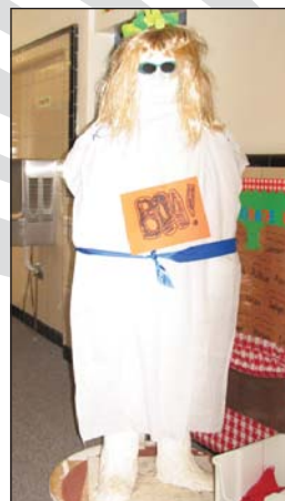
Even TJ’s plaster statue of Thomas Jefferson wears a costume.