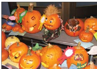
Entries in the TJ Pumpkin Contest