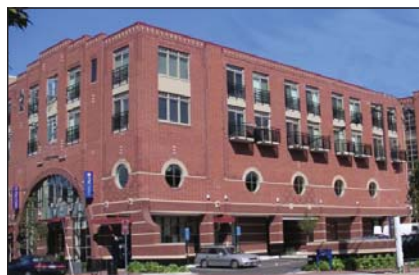
The Read Building on W. Broad Street.

Because of their central location, residents are able to walk to many places like Mary Riles Styles Library, Cherry Hill Park and the Falls Church Farmer’s Market. They might even be seen walking to school!