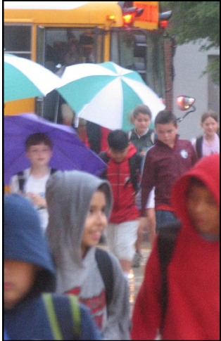
Rain slickers, umbrellas and hoodies were added to the back-to-school list for the first day of the 2006-2007 school year.